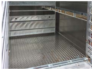
30mm timber floor with a one piece, fully sealed 3mm aluminium tread plate floor covering.