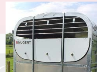
Nugent's unique trio of fold down front panels allow farmers to control the level of air flow through the trailer. This reduces drag to provide for a better towing trailer, while significantly decreasing fuel consumption.