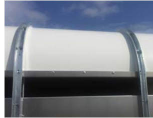
Aluminium spouting reinforces the roof.