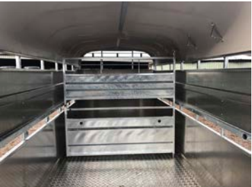
Additional dividing gate.