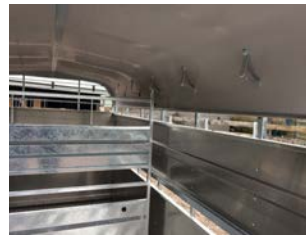
Multiple dividing gate hangers for tailored sectioning of each load.