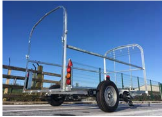
Chassis made from angle iron with a fully welded frame for maximum strength and endurance.