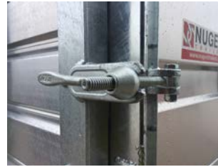
Robust taildoor fastener. Winders are simple but effective and help to strengthen the trailer when the ramp is closed.