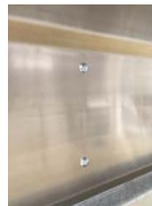
Mono bolts pin and collared joint fabrication.