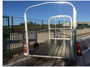
30mm preserved timber floor with aluminium treadplate for a fully sealed finish.