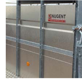
Closed in bottom vents.