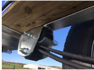
Dual Drive suspension.