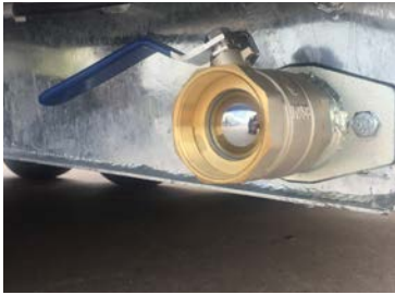
Collection tank— fully welded and sealed —hygienic disposal.