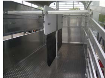
Horse partitions (12x7ft high trailers).