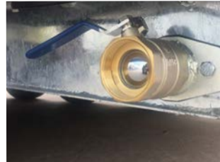
Collection tank lever valve allows for simple, safe and hygienic disposal.