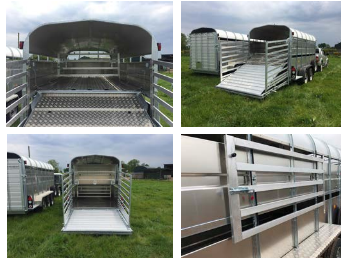
Fold-up sheep decks are conveniently and safely stowed for quick and easy access. They can be deployed without the need for any tools or special equipment. Dividing gates are supplied in both heights for when decks are in or out of use.