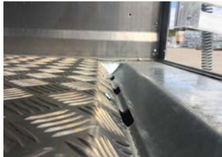
Metal collection tank designed for maximum efficiency.