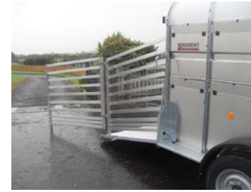
Additional pair of loading gates.