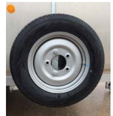
Spare wheel with support.