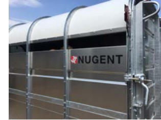
Folded sides for extra strength.