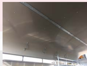
Tough central roof structure with edge retainer.