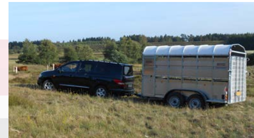
The Nugent 7 foot high option is suitable for transporting horses with horse partition fitted as an optional extra.