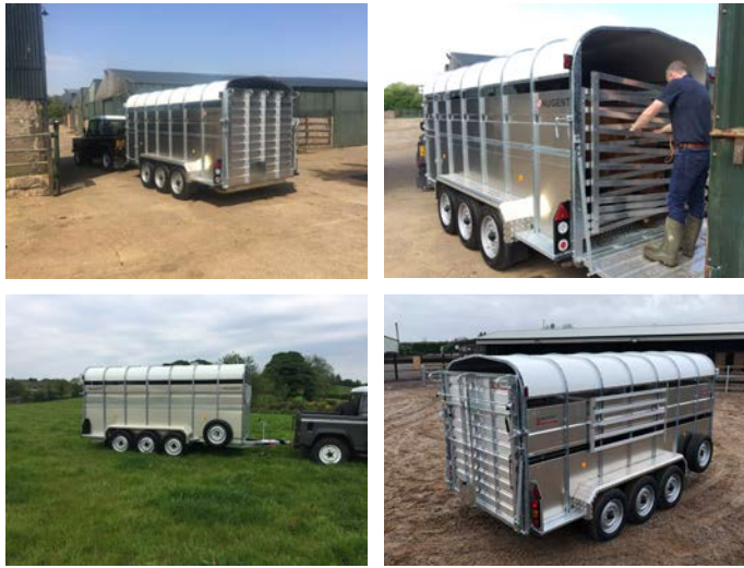
Tri axles are optional on 12 and 14 foot models and offer extra stability. Aluminium mudguards are standard on all tri-axle models.