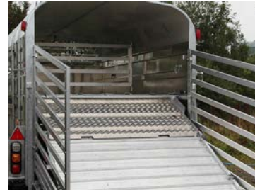
Fold-up sheep decks.