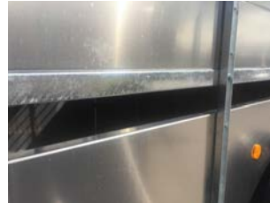
Incorporated box section for strength and reinforcement.