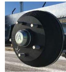
Market leading Knott brakes and axles.