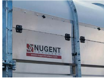
Flaps (hinge and clip system).