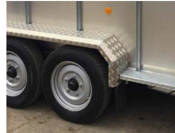
Aluminium mudguards for twin axle models.