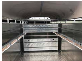
Internal dividing gate with multiple hanging locations.