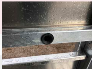
Gate retaining plunger.