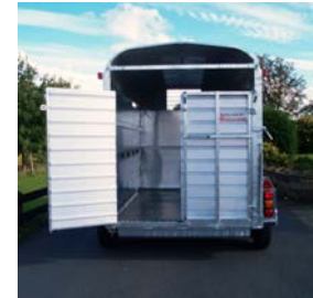
Dual Doors. Can also be used as a ramp.