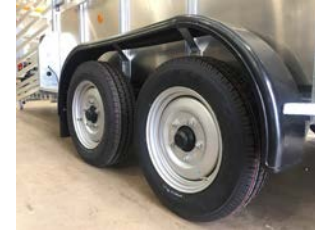
Wheels: bigger surface area tows better in fields and gives extra stability on the road. Less rolling resistance, giving a better fuel efficiency & reducing the pull on the towing vehicle.