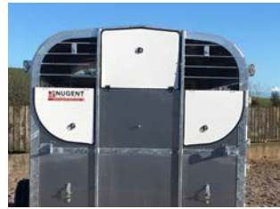
Sectional fold down front panels.