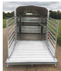
Reinforced loading ramp.